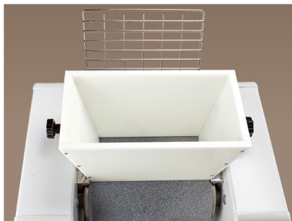
Tramoggia - Hopper - Tremie