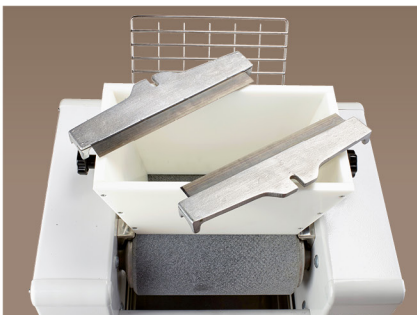
Raschiatori - Scrapers - Racleurs