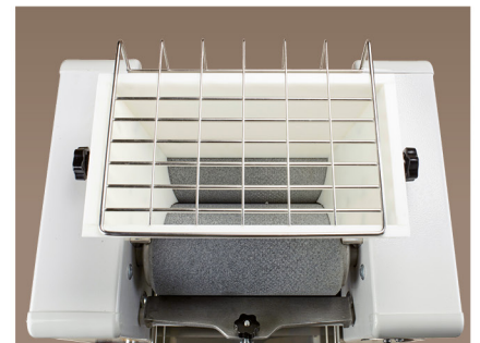
Griglia di protezione - Protection grid - Grille de protection