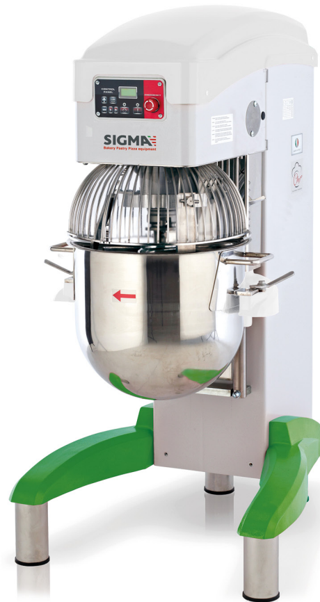
Salita e discesa della vasca motorizzata Motorized bowl lifting Montée et descente cuve motorisée