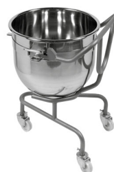
Carrello per vasca Trolley for bowl Chariot de cuve