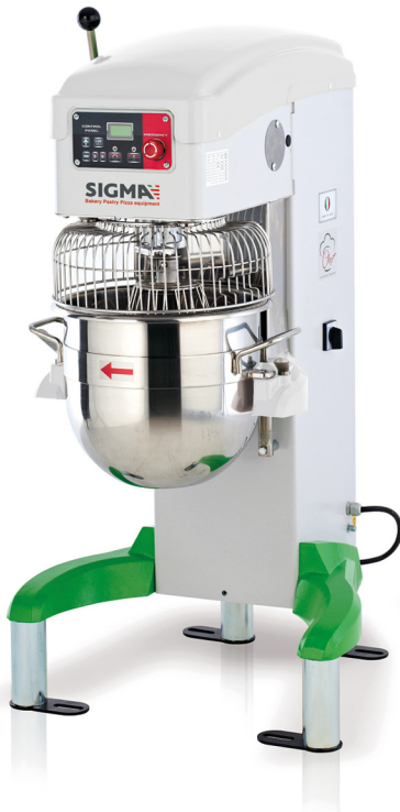
Salita e discesa della vasca manuale Manual bowl lifting Montée et descente cuve manuelle