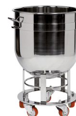
Vasca con ruote Bowl with wheels Cuve sur roulettes