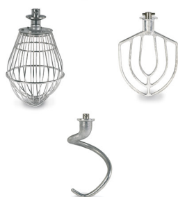
Kit di riduzioni vasca e utensili Smaller bowls and tools Equipements de réduction (10/20 - 20/30 - 20/40 - 40/60)