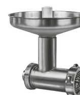
Tritacarne Hachoir à viande Meat mincer